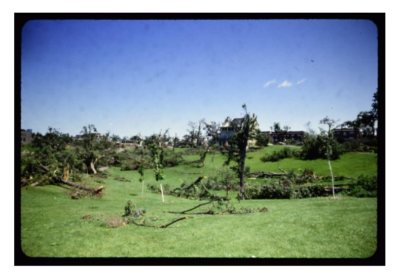
Figure 2. Extensive tree damage to parkland adjacent to the cosmetically-damaged Theodore Wirth home and Minneapolis Park Commissioner's residence, 40<sup>th</sup> and Bryant.

The tornado struck during what had already been a stormy weekend. Heavy rains on the 12<sup>th</sup> and 13<sup>th</sup> had caused minor flooding, and an outbreak of thunderstorms on the morning of the 14<sup>th</sup> produced two tornadoes in far southern Minnesota, along with thunderstorm winds in excess of 100 mph in Dakota County. Immediately prior to the tornado forming, golfball-tobaseball-sized hail had been reported near Mound, and large hail continued to be associated with the parent thunderstorm during and after the tornado's passage. As the tornado was entering Minneapolis, another tornado from a different thunderstorm struck a