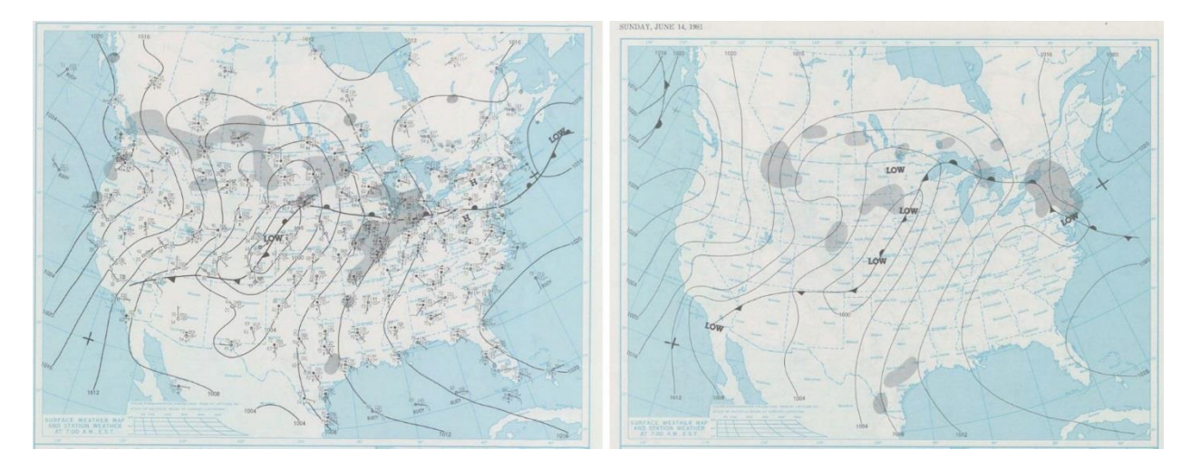
Figure 3. Daily weather maps from 7 AM CDT on Saturday June 13 (left) and Sunday June 14 (right), 1981. Cold front right image likely retrograded (moved westward 50-100 miles during the day, as the low circulation in northern Minnesota intensified.

Storms from southwestern Minnesota through the far southern Twin Cities area on the morning of the 14<sup>th</sup> were especially severe. Straight-line winds tore roofs off of barns and uprooted trees in Jackson and Nobles around 5 AM CDT, as wind-driven golf ball-sized hail damaged thousands of acres of crops; shortly after that, a tornado damaged buildings in Lake Crystal (Blue Earth County); straight-line winds then produced measured 60-70 mph gusts in Mankato; another tornado significantly damaged homes and businesses in Le Center (Le Sueur County) at 6 AM. The storms then formed a ferocious bow echo with winds estimated by the National Weather Service to be up to 120 mph in Rice and Dakota counties, where barns were destroyed, outbuildings collapsed, over 100 cattle were killed, roofs of homes were torn off and blown for hundreds of yards, and where crop damage from wind-driven hail was extensive. By 7 AM, the most severe storms had passed into Wisconsin, but scattered thunderstorms with heavy rains persisted over the Twin Cities area. Storm survey damage estimates from the morning storms exceeded $90 M (2016), with much of that damage coming to agricultural buildings and crops.