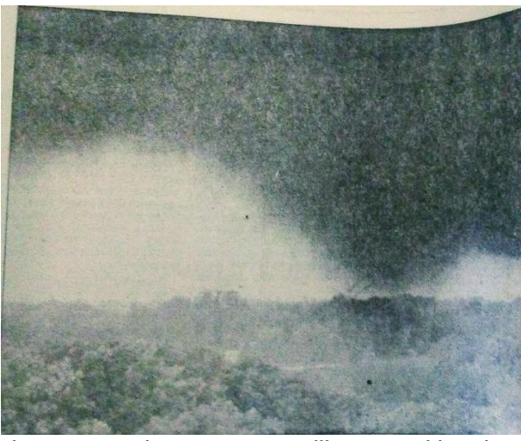
Figure 1. Tornado seen over Roseville, approaching Rice St. and Larpenteur Ave from the southwest.

The tornado killed one person directly along the southwestern shore of Lake Harriet, one indirectly during clean-up, injured at least 83 along its track, and produced over $124 M in damages (2016)